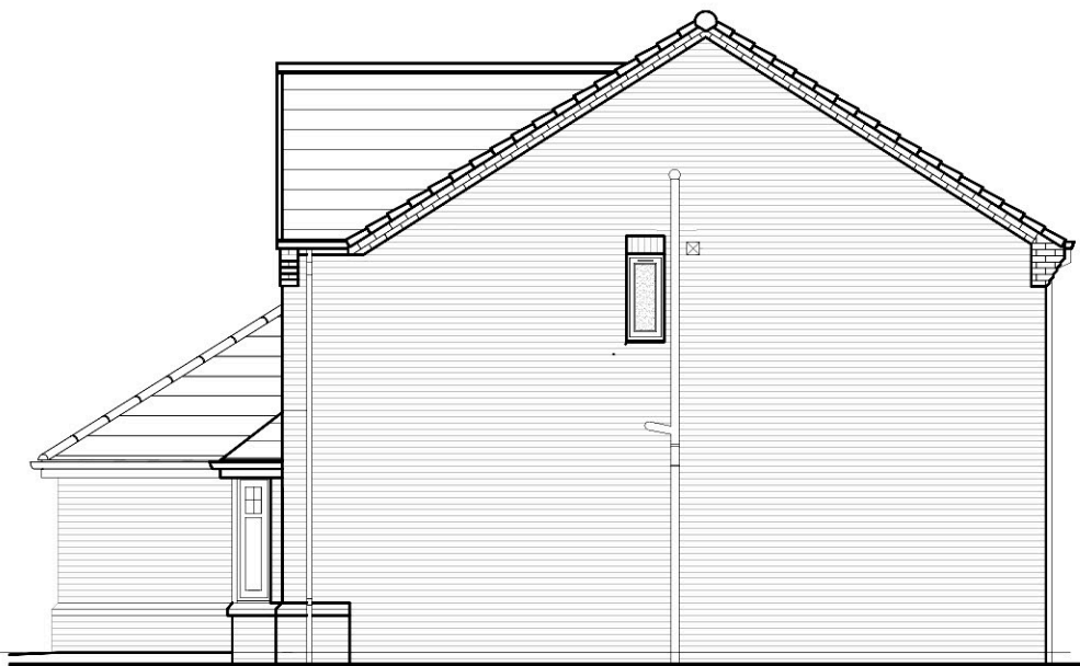
SIDE ELEVATION Ingleton