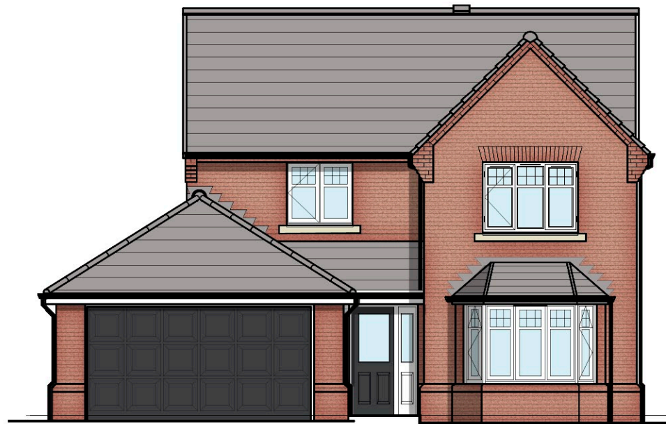
FRONT ELEVATION Ingleton