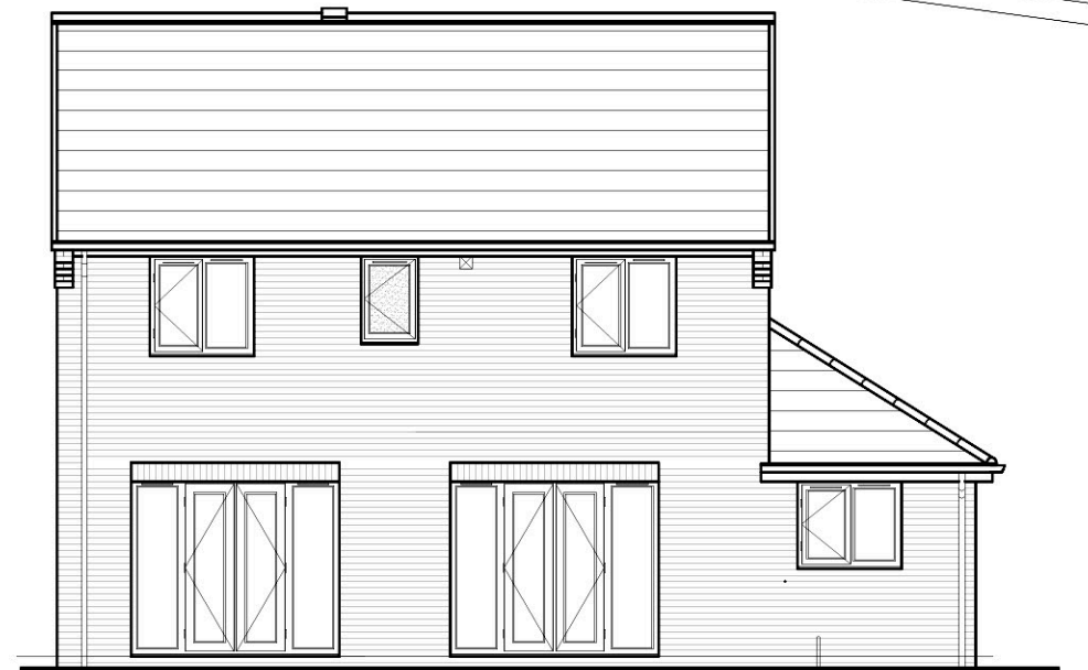
REAR ELEVATION Ingleton