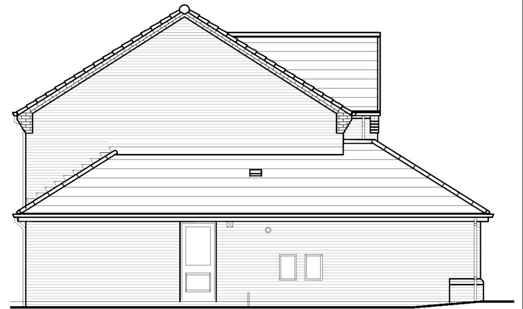
SIDE ELEVATION Ingleton