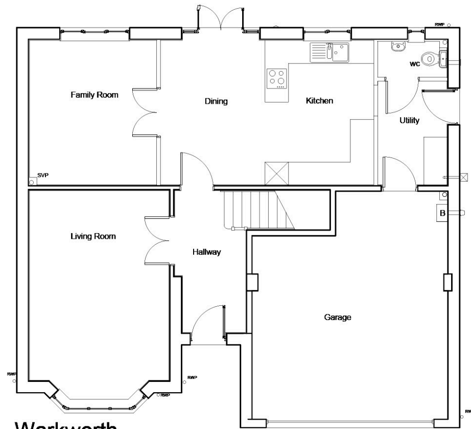
Warkworth GROUND FLOOR PLAN